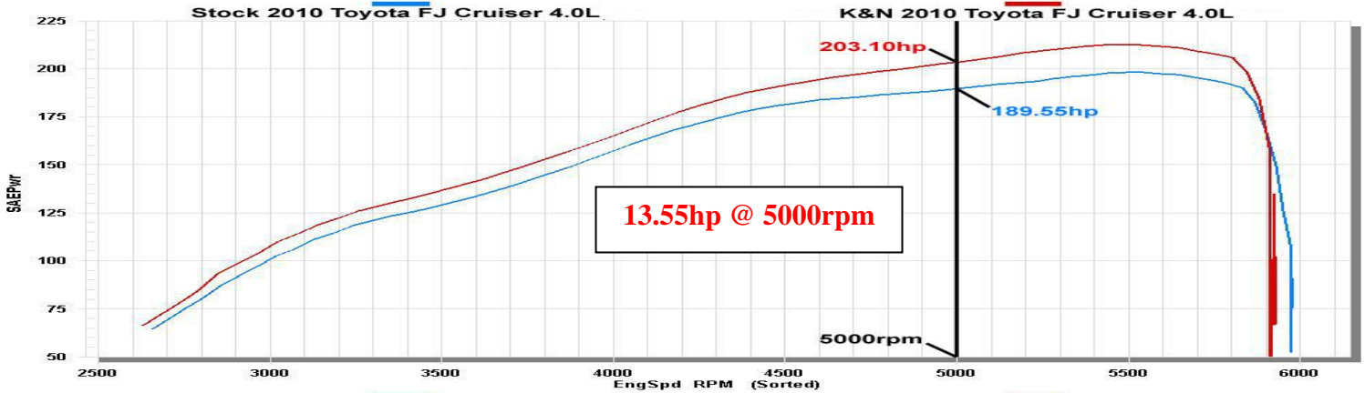
Data Group 1