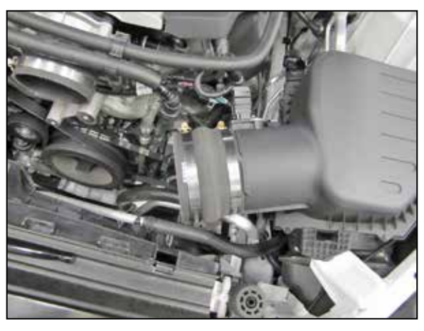
12. Install the provided hump coupler (08695) onto the mass air sensor and secure with the provided hose clamp.