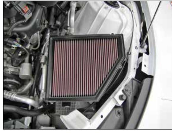
10. Install the provided K&N ^{\mbox{\tiny \$}} air filter. Reinstall the lid and secure with the factory screws.