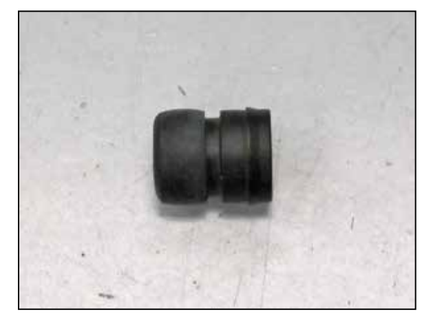
7. Install the Provided cap onto the quick disconnect union provided.