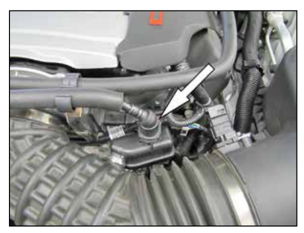
3. Disconnect the crank case vent hose from the intake tube.