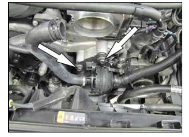
5. Remove the two bolts securing the sound drum to the engine.