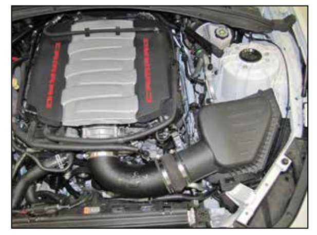
16. Reconnect the vehicle's negative battery cable. Double check to make sure everything is tight and properly positioned before starting the vehicle.

17. The C.A.R.B. exemption sticker, (attached), must be visible under the hood so that an emissions inspector can see it when the vehicle is required to be tested for emissions. California requires testing every two years, other states may vary.