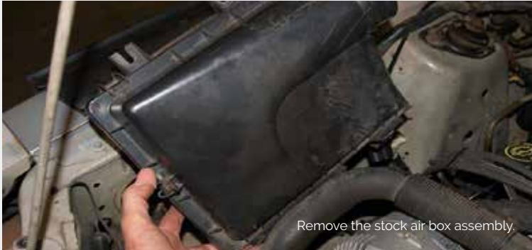
Remove the stock air box assembly.

Loosen clamp on inlet tube at throttle body, unbolt Mass Air Meter bracket, remove the two nuts that secure the air box, remove entire stock air intake.