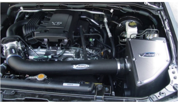
INSTALLED VOLANT 12540 KIT

17. Finally, place the CARB Compliance Label from the small hardware bag in a visible spot on the top of the radiator bulkhead. Clean the bulkhead before applying the label.