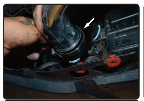
13. Install long 2.5" hump hose with clamps to the hot side of the intercooler. Do not tighten.