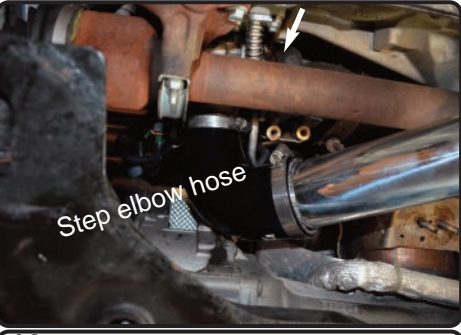
13. Install the provided step elbow hose with clamps to the turbo. Secure and tighten. Re-adjust if necessary.