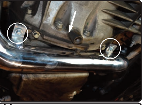
14. Install the hot side of the intake pipe to the vehicle and position brackets to the engine. Locate the 2 thredded inserts, and secure using provided M6 hex screw and small washer. Do not tighten.