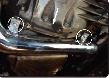
14. Once positioned, and proper clearance. tighten all clamps and M6 hex screws.