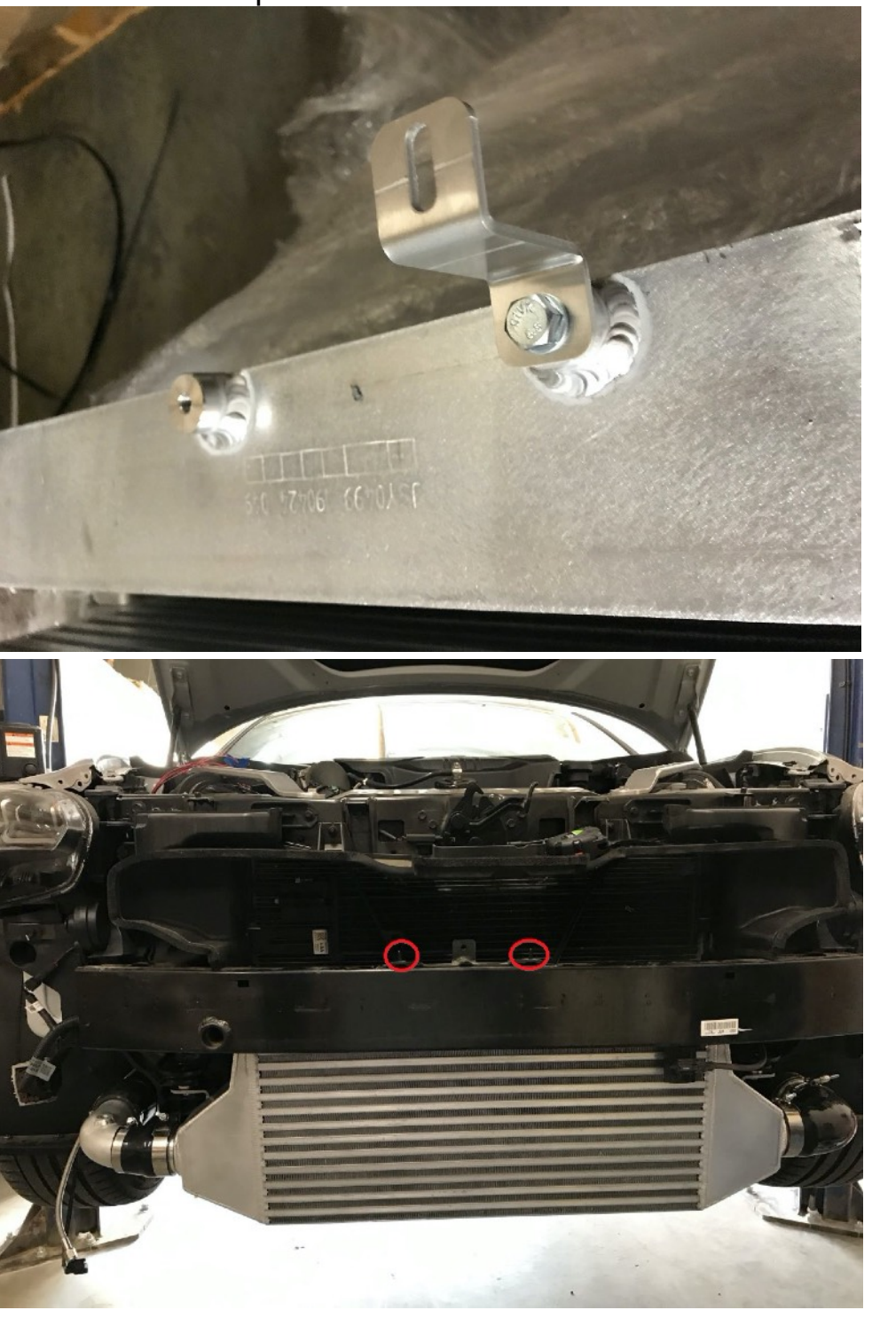
Installation is now complete.

Install the two Z brackets on the top of the bumper support with the provided bolts and nuts.