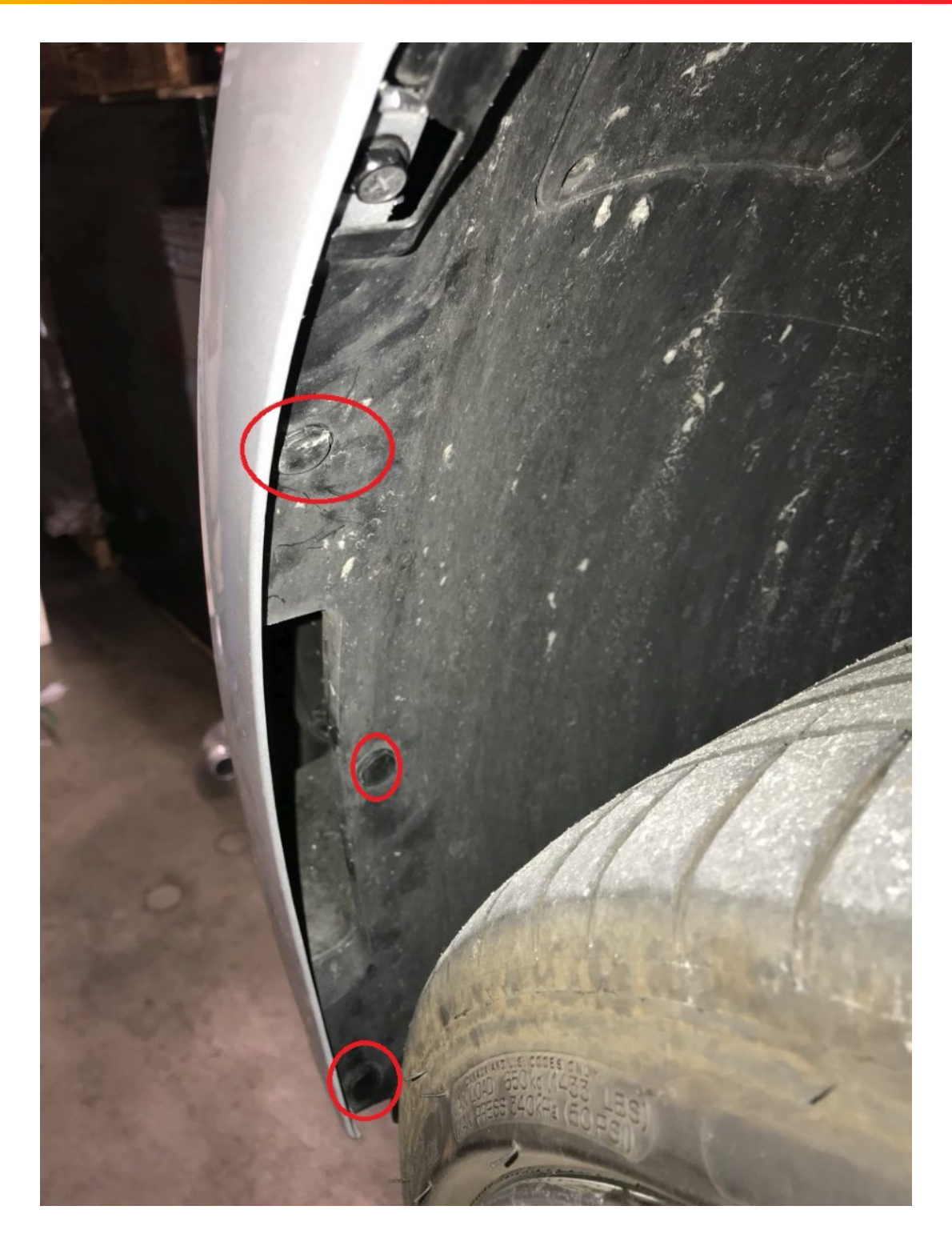
Now you can slowly pull the bumper off. There is a harness that will need to be unplugged from the bumper.