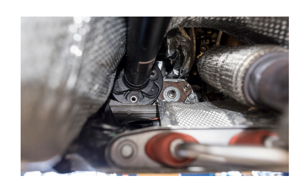
9.REMOVE TWO 13MM NUTS FROM THE DOWNPIPE SUPPORT BRACKET