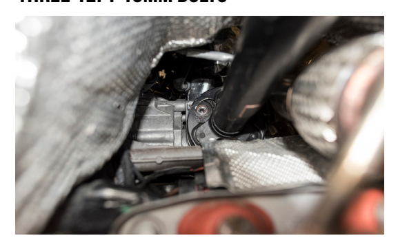
18. REALIGN THE DRIVE SHAFT AND INSTALL THREE 12PT 10MM BOLTS