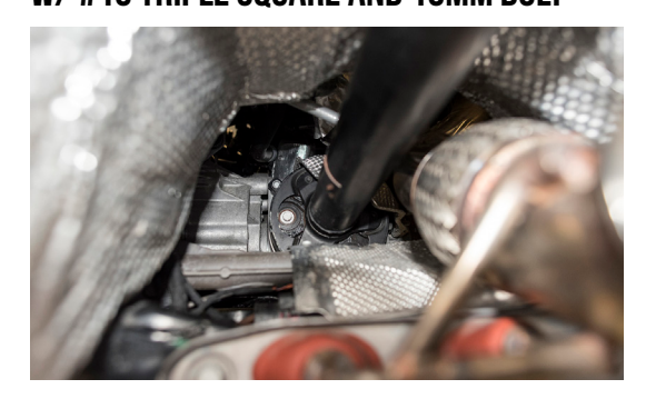
20. REINSTALL HEAT SHIELDS - DRIVE SHAFT W/ #10 TRIPLE SQUARE AND 16MM BOLT