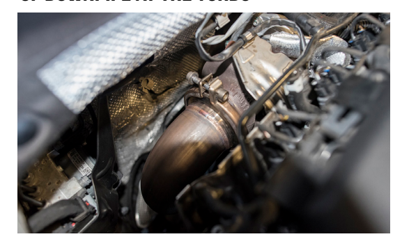
16. TIGHTEN V-BAND CLAMP FULLY TO TOP OF DOWNPIPE AT THE TURBO