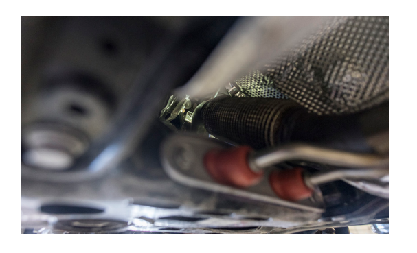
10. LOOSEN TWO 13MM NUTS FROM THE EXHAUST CLAMP