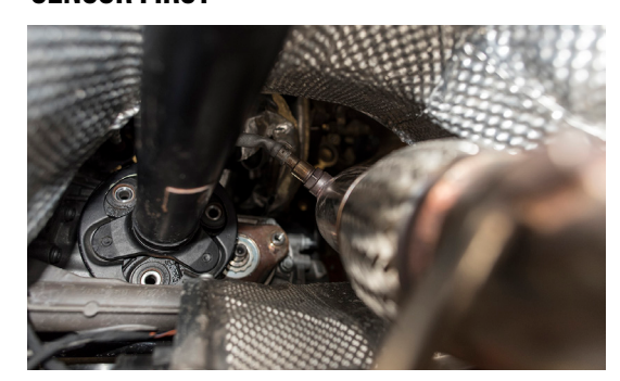
17. REINSTALL 02 SENSOR - SCREW ON SENSOR FIRST