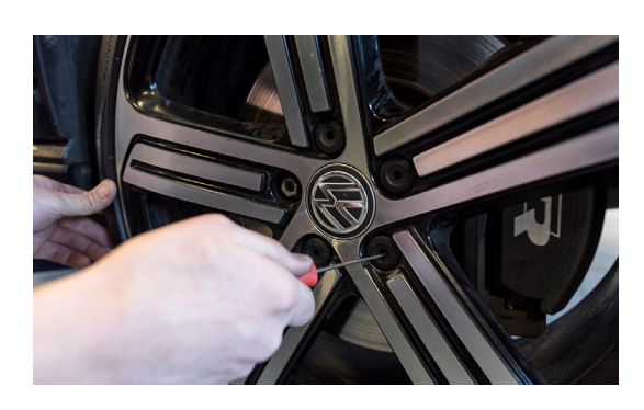
2. REMOVE PASSENGER FRONT WHEEL - 17MM