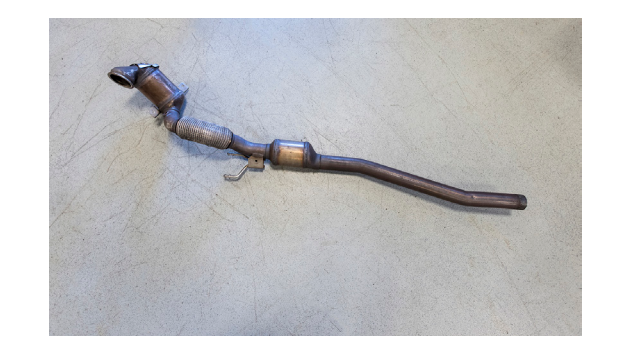
15. INSTALL FRONT SECTION OF MAP DOWNPIPE INTO TURBO AND RUBBER MOUNTS