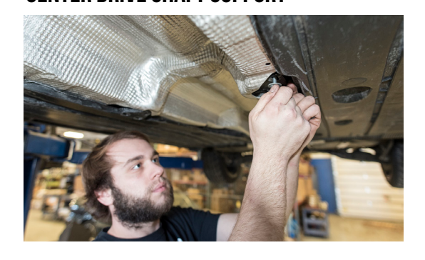
19. REINSTALL FOUR 13MM BOLTS HOLDING CENTER DRIVE SHAFT SUPPORT