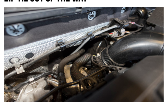
THEN ROUTE LINE AS TO NOT TOUCH TURBO, ZIP TIE OUT OF THE WAY