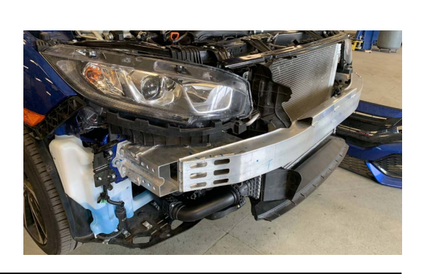
5A-C. REMOVE PLASTIC SHROUD PICTURED, THIS WILL ALLOW YOU TO ROUTE THE COOLER LINES(REMOVE CLIPS AND PULL) THEN REINSTALL THE HEADLIGHT (5 10MM BOLTS)