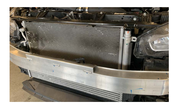
8A-E. ATTACH COOLER ASSEMBLY TO VEHICLE BY REUSING THE BOLTS YOU REMOVED FROM THE AC CONDENSER, SECURING BOTH AC CONDENSER AND OIL COOLER FROM THE SAME MOUNT