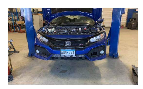
18. REINSTALL BUMPER COVER AND UNDERTRAY