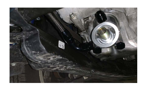
13A-D. ROUTE SHORT LINE FROM PASSENGER SIDE OF OIL COOLER TO THE TOP HALF OF THE OIL COOLER, TIGHTEN BOTH HOSE ENDS AND ORB FITTINGS