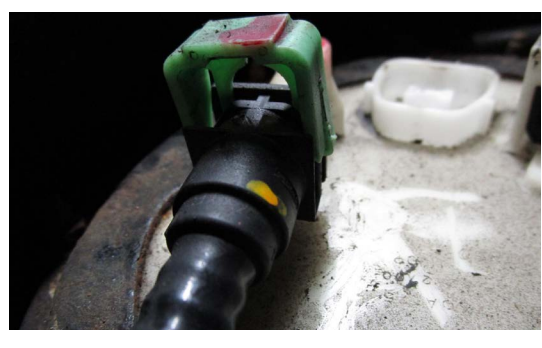
7. PULL SENDING UNIT FROM THE CAR, AND Disconnect fuel line from bottom of Housing (be careful, may be filled with Fuel when pulling out)