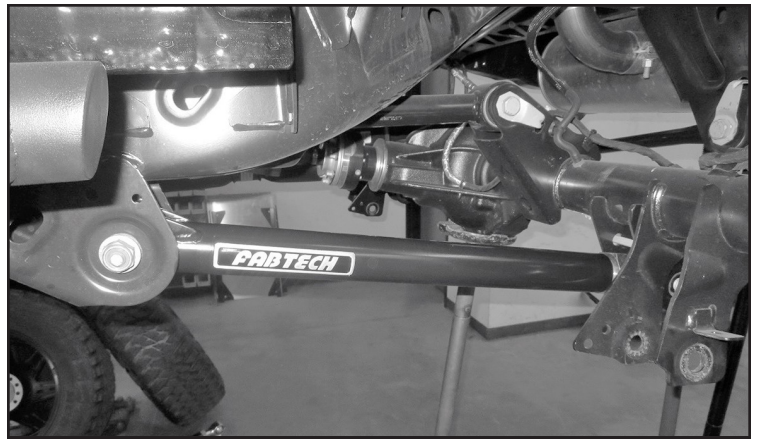
FIGURE 3 - STEP 4