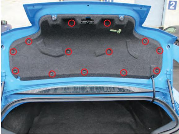
Step 1 Open the trunk and remove the various push pins securing the trunk lid panel to the trunk.