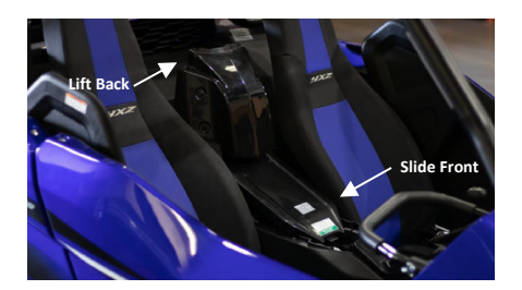
PART LIST/NUMBERS CAN BE FOUND ON PAGE 4

STEP 2. Remove the stock air duct from the air box by squeezing the top and bottom of the air duct and pulling it forward. Carefully detach the foam seal from the stock air duct and install foam around the KWT air duct adapter (9).