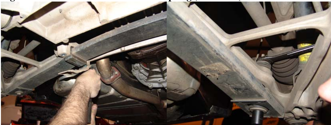
Figure 8a and 8b Removal of rear leaf spring (C5 shown)

Now that the spring has been removed, take the upper shock mounts loose from the car and remove the rear shocks. This is done by removing the two 10mm bolts holding the upper shock mount plate to the frame of the car.