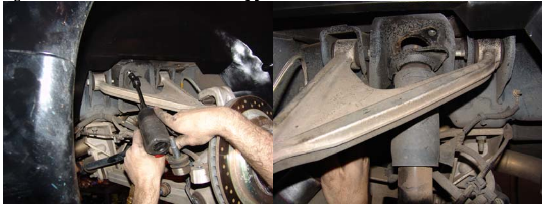
Figure 9a and 9b Removal of rear upper shock mount.

Pull the shock free, and clean off any debris that might be on the frame. We have now completely removed the shock and spring system from the car and are ready to install our new LG coil over suspension package.