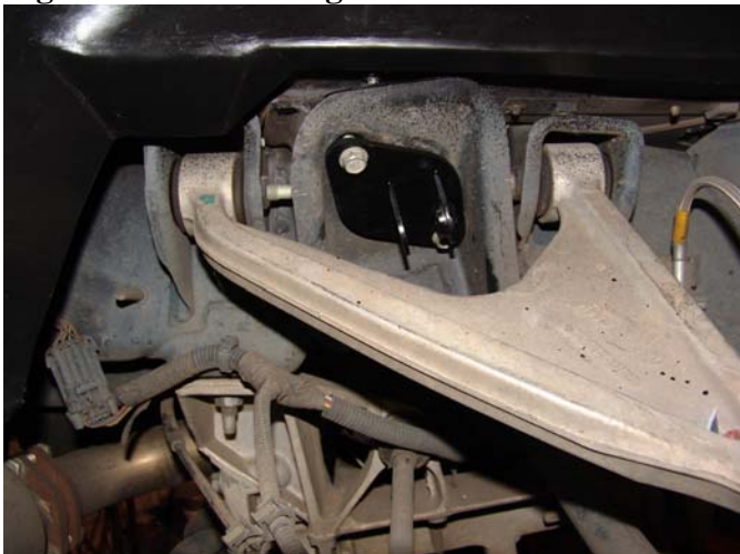
Figure 13: C5 Passenger side mount installed

Once the upper mounts have been installed and tightened down we can now install the rear shocks into the car. First start by sliding the coil over up from the inside between the tie rod end and the half shaft, once it is up slide the lower mount into place and then install the lower bolt. You can also start the upper bolt first, and move the lower control arm up into place, which ever you feel is easiest for you.