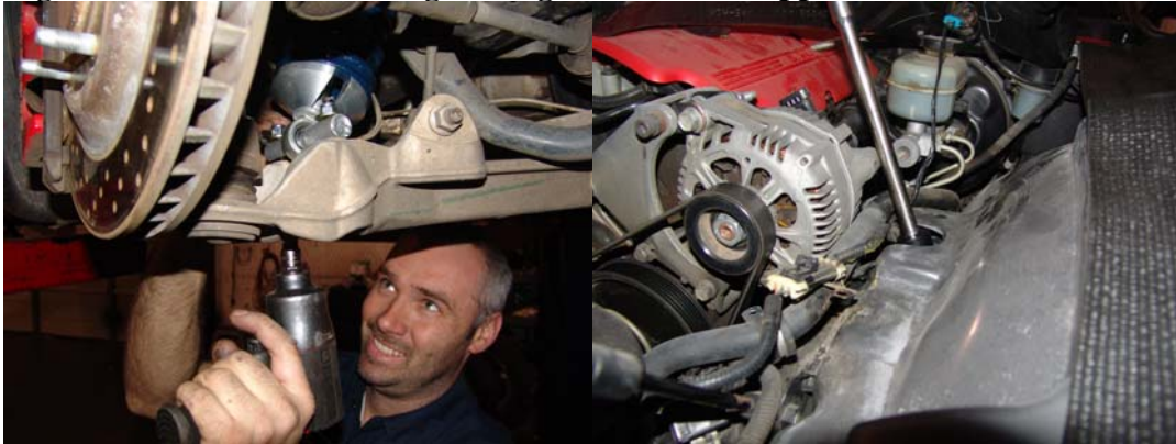
Figure 12a and 12b: Final tightening of lower and upper mounts

Once both coil overs are installed, tighten the upper shock mount at the frame. The shock will want to turn while doing this, make sure that the bolt holding the shock in place is parallel to the frame once it is tight and not at an angle.