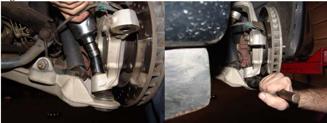
Figure 3a and 3b (removal of lower control arm nut)

You will only be removing one lower control arm and upright, one on the front and one on the rear. You may now also remove the shock from the passenger side of the car. Make sure that all rubber shock mounts have been removed from the chassis side of the car as well at this time, these will not be needed.