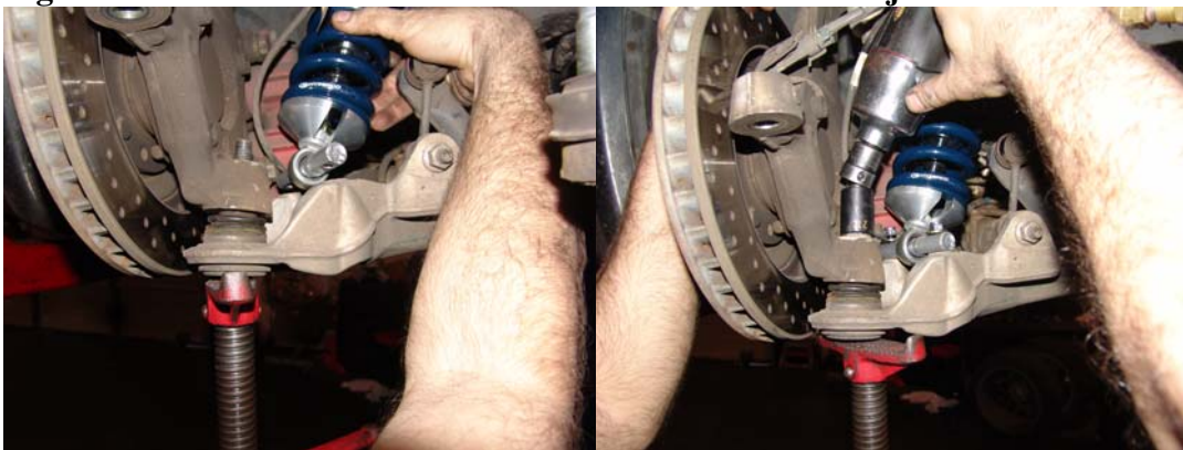
Figure 11a and 11b: Install of lower shock mount and ball joint

The flat side of the mount should be placed against the lower control arm. One washer will be between the head of the bolt and the lower control arm, and the other will be between the nut and the mount. The bolts will insert from the bottom going up. This is best done with either a helper or a floor jack to raise the control arm assembly. Once the passenger side is finished, we can re-assemble the lower control arm at the upright on the driver side at the taper so that we can install the coil over just as we did on the other side.