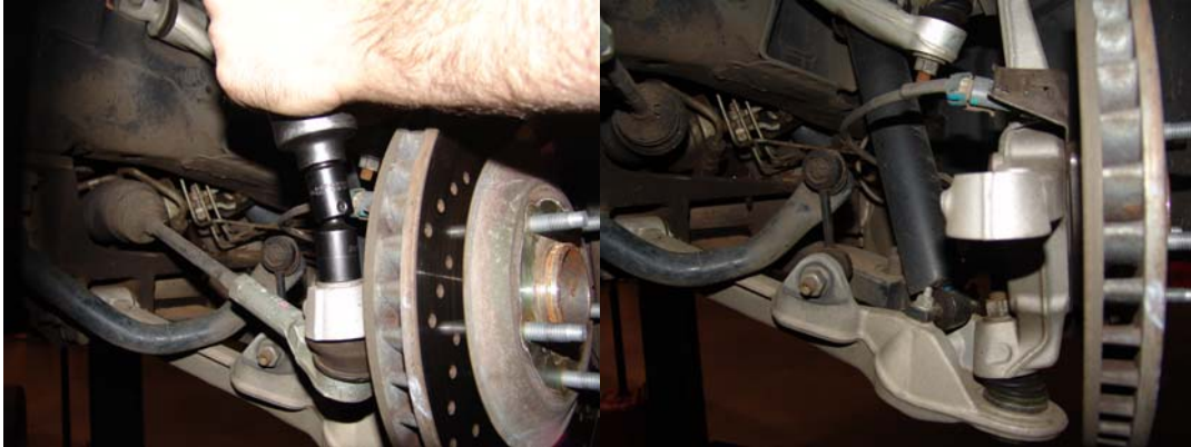
Figures 2a and 2b (Removal of tie rod end):

Once the tie rod ends are removed from both sides we must now separate the upright from the lower control arm to remove the factory leaf spring. This is done by first loosening the 22mm nut at the lower control arm first, but do not remove it completely. You will see two flat spots on the upright, tap these with a hammer to loosen the taper at the pin and you should see the lower control arm separate from the upright. If it does not, again a pickle fork may be needed. Remove the end link at the sway bar to the control arm and pull free. At this point, remove the bolts holding the lower mount to the control arm so that the arm can be pulled down free from the spring.