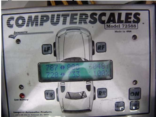
Figure 15: Scale example

Keep in mind, you can not change front, rear, or side percentage without physically moving, adding, or removing weight. The cross can be adjusted by changing the spring adjusters on the shocks. This change will make sure the car handles the same at the limit on both right and left hand corners.