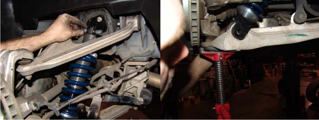
Figure 14a and 14b: Install of rear coil over

Finish the install by installing sway bar end links, and making sure all mounts, nuts, bolts, are tight. Also make sure that all wires, and fluid lines are clear of the springs and shocks so that they are not pinched.