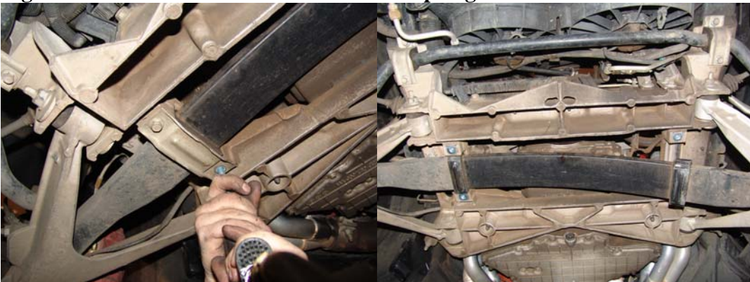
Figure 6a and 6b Removal of the front leaf spring

Start by removing the driver side first as this has the control arm removed and will take the remainder of the pressure off of the spring. Move to the passenger side and pull the spring from the car.