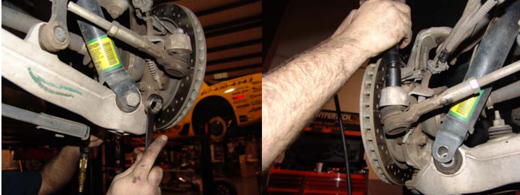
Figure 7a and 7b Removal of lower shock bolt and tie rod.

This next section will differ slightly between C5 and C6 cars. On C5 cars you will start by removing the leaf spring mounts from the car, then the outer bolts holding the spring to the control arms. On C6 Corvette's you will have to separate the lower control arm from the upright just as you did at the front of the car then remove the spring mounts from the K member. Remember to remove the mount on the side that you separated the control arm from first, it will have the least amount of load on the spring.