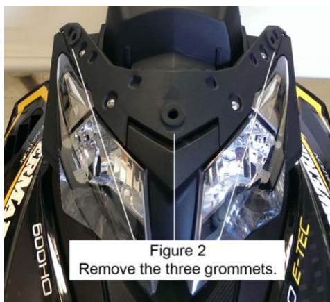
Figure 2 Remove the three grommets.