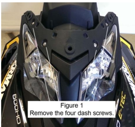
Figure 1 Remove the four dash screws.