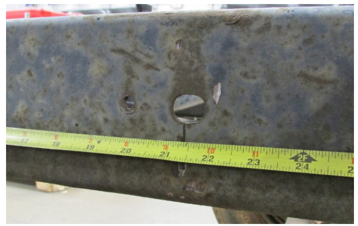
Figure 3 – Locate Notch Centerline

5. Place the C-notch template so it sits on the top of the frame and wraps around the outside framerail. Line up the centerline mark of the C-notch with the slot in the template (Figure 4).