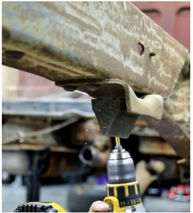
Figure 1 – Remove Rear Axle Bump Stop Bracket

3. Remove the brake line clamp from inside the passenger framerail and move the line away from the framerail (Figure 2).