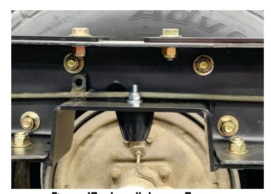
Figure 10 - Install Jounce Bumper

13. Install the jounce bumper into each frame notch assembly at the C-notch using the provided 5/16"-18 Nylock nut and washer and tighten (Figure 10).