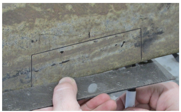
Figure 5 - Trace Frame Notch Cutout

7. Cover the fuel tank(s) with a welding blanket and cut along the traced lines to notch the framerail. Grind all edges smooth (Figure 6). NOTE: We recommend cutting the frame and installing the frame notch bracket on one side of the frame before cutting the other framerail for strength.