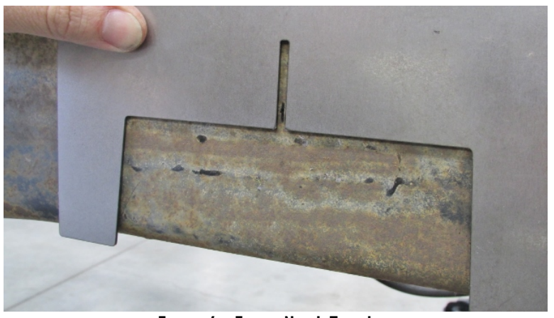
Figure 4 - Frame Notch Template

5. Place the C-notch template so it sits on the top of the frame and wraps around the outside framerail. Line up the centerline mark of the C-notch with the slot in the template (Figure 4).