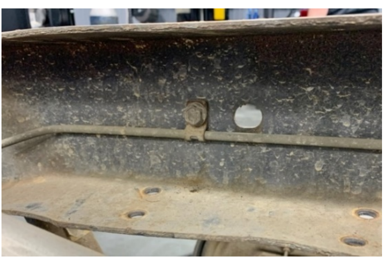
Figure 2 – Remove Brake Line Clamp

3. Remove the brake line clamp from inside the passenger framerail and move the line away from the framerail (Figure 2).