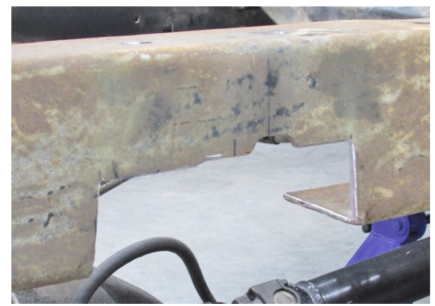
Figure 6 - Notch Frame Rail

8. Locate the frame notch bracket assemblies from the kit. There is a left and right hand side bracket so make sure you use the correct bracket for the correct side of the frame (Figure 7).