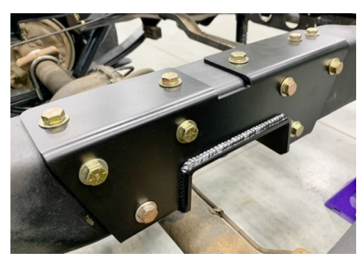
Figure 9 - Install Frame Notch Assemblies (RH, Passenger Side)

12. Once all hole locations are drilled out, install the frame notch bracket assembly to the frame using the provided 7/16"-20 x 1-1/4"L hex head bolts, Nylock nuts and washers. Then, install the 3/8"-24 x 1-1/4"L hex head bolts, Nylock nuts and washers (Figure 9). Use anti-seize on the threads of the bolts. Torque the 7/16"-20 hardware to 50 ft-lbs. and the 3/8"-24 hardware to 30 ft-lbs. Repeat Steps 4-12 for the other side of the truck.