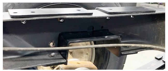
Figure 8 - Drill Framerail