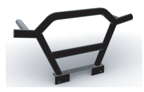
■ (1x) Front Bumper