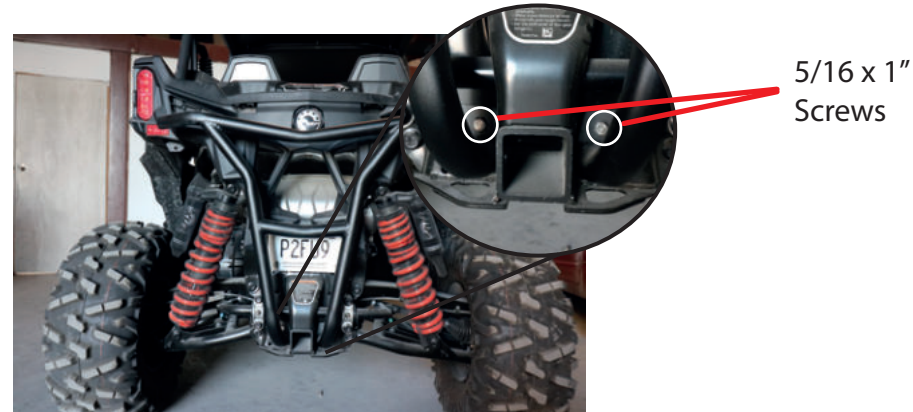
5/16 x 1" Screws