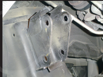
B. Modified idler support bracket for fitment of your new Death Grip Idler Support