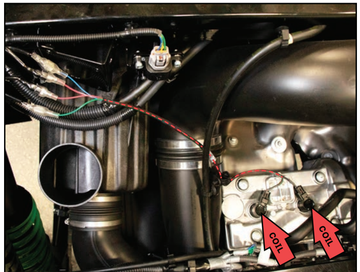
DYNOJET COILS AND WIRING HARNESS

Reinstall the cargo bed and removed bodywork.