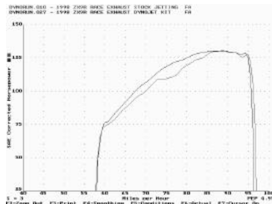
This graph shows a typical gain with a Dynojet jet kit.

For mildly tuned machines using the stock airbox, with stock or K&N filter. May also be used with a good aftermarket exhaust system K&N filter #KA-0021