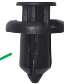
Right ear: 10mm retainer clip