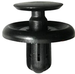
Left ear: 7mm retainer clip

There are 3 fastening points that require 3 distinct fasteners. Check out the graphic below to match each fastener to its fastening point.