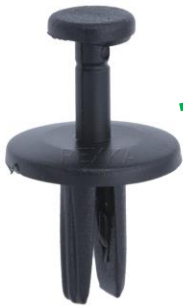
Lower ear: mud skirt clip