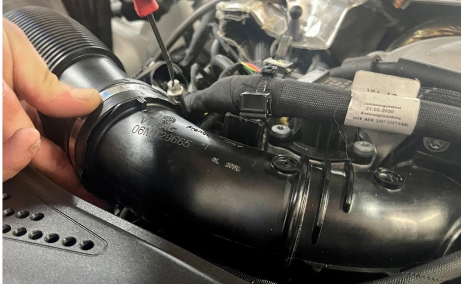
Step 4 Slide the hose off of the turbo inlet.

Loosen the hose clamp on the intake hose.