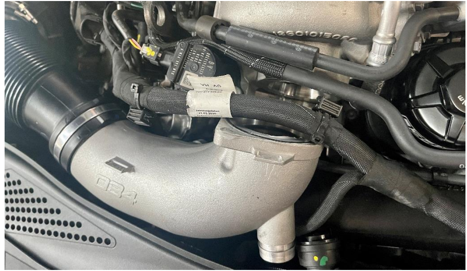
Step 14 Using a 5mm Allen, tighten both bolts to secure the 034 turbo inlet to the turbo.

Step 13 Slide the bottom of the turbo inlet flange to engage with the bolt installed previously.