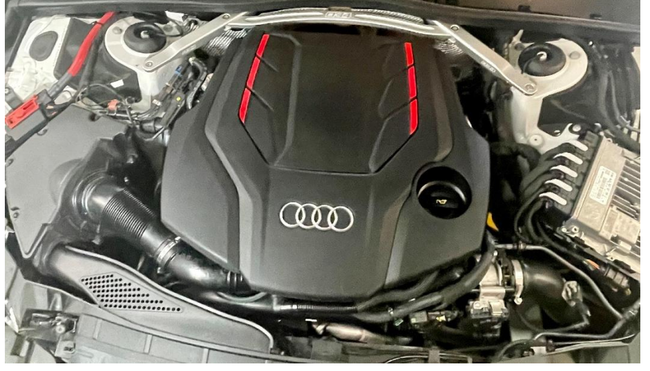
Step 2 Remove the engine cover by pulling up on it.