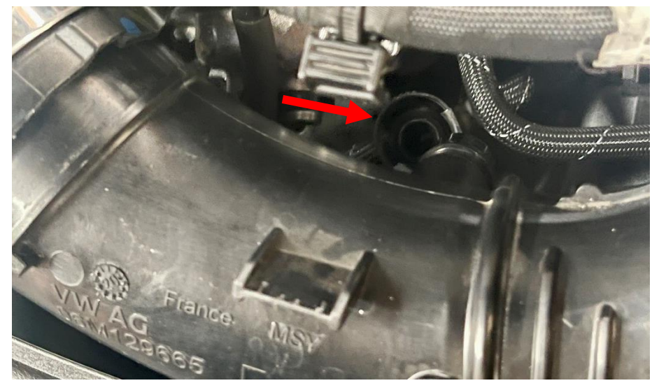
Step 9 Extract the turbo inlet.

Squeeze the pinch fitting to disconnect the vacuum line from underneath the turbo inlet.