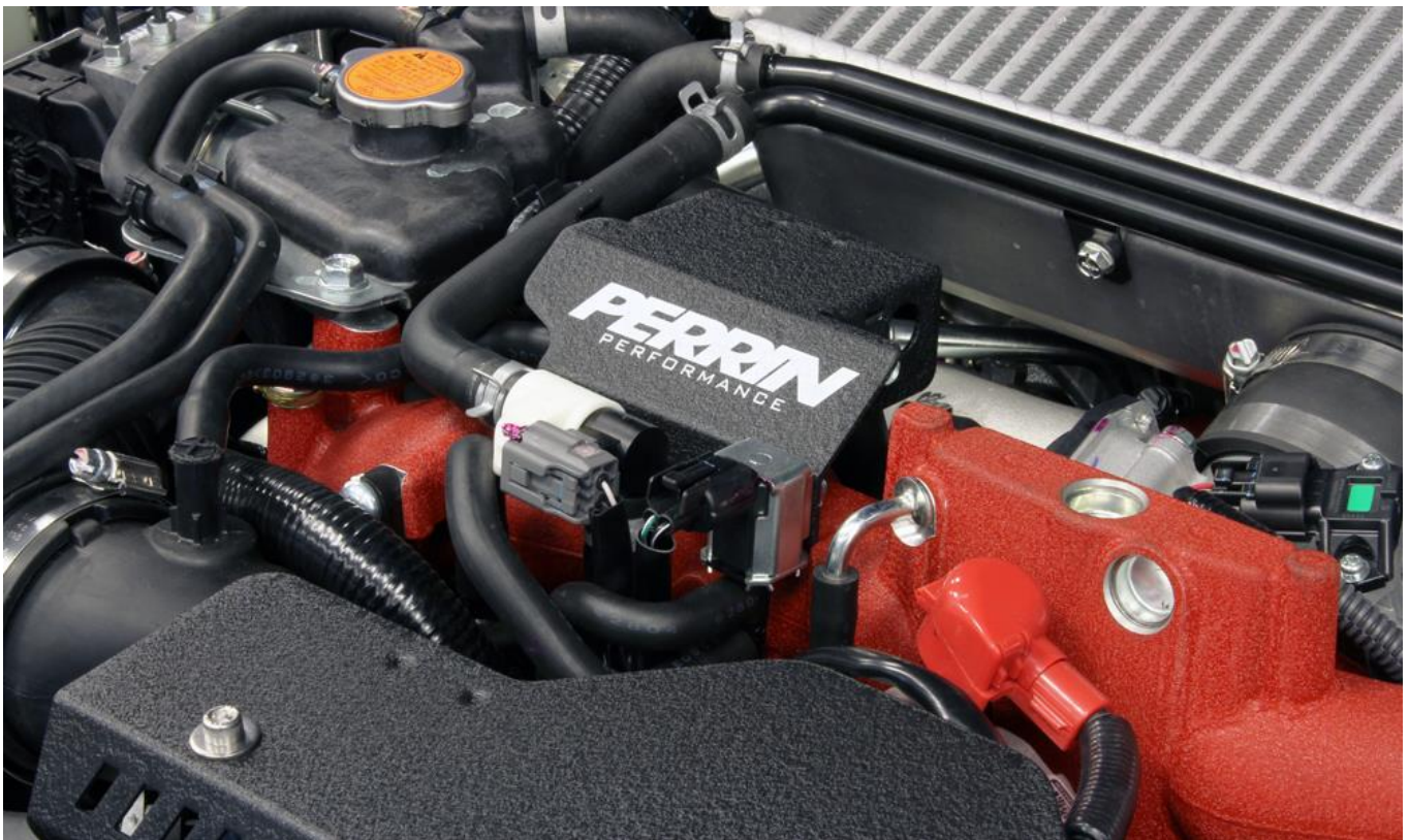
Installation shown with PERRIN EBCS Pro installed in place of OEM boost solenoid.