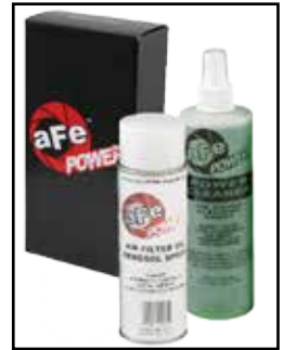
Blue Aerosol Restore Kit