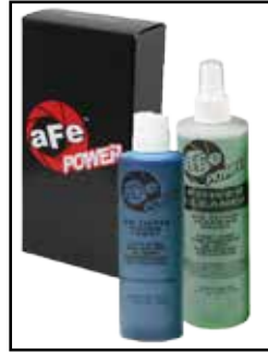
Blue Squeeze Restore Kit