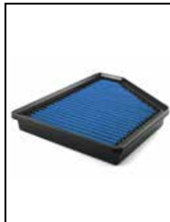
Direct Fit Air Filter