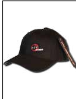
aFe Power Hat