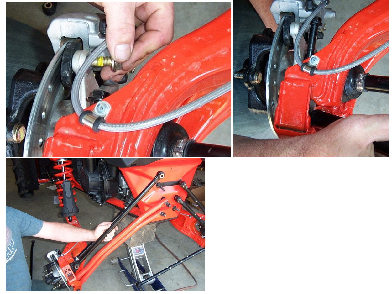
10. Connect the lower radius bars to the frame first.