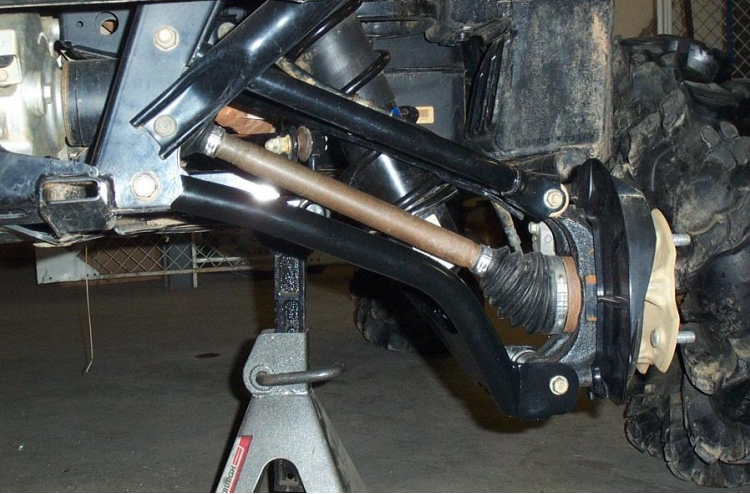
16) Once you have installed the control arms, place the wheels back on the UTV. Torque all lugs to factory specifications and lower the jack.