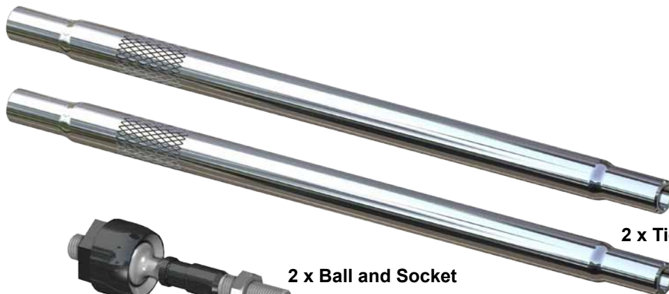
2 x Tie Rod Shaft