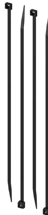
4 x Zip Tie

Read instructions and view illustrations before beginning.