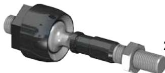
2 x Ball and Socket