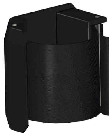
Mount Clamp Qty (2)