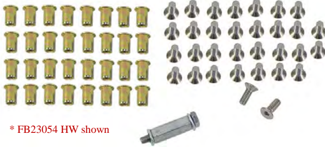
* FB23054 HW shown