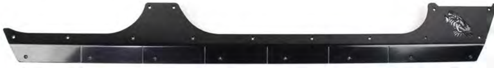
* FB23053 (4DR) shown