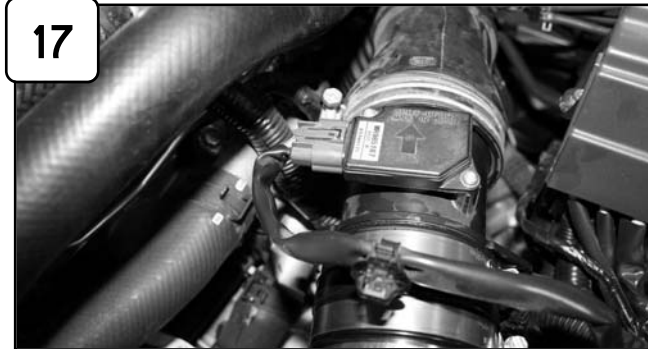
Re-connect MAF sensor harness. Tighten intake clamp using 10mm socket or wrench.