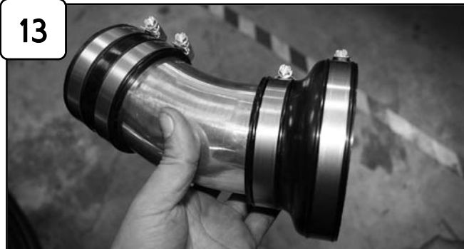
Attach couplers with clamps to intake tube.