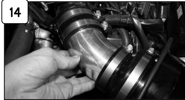
Install and position intake tube assembly to MAF sensor and adaptor.