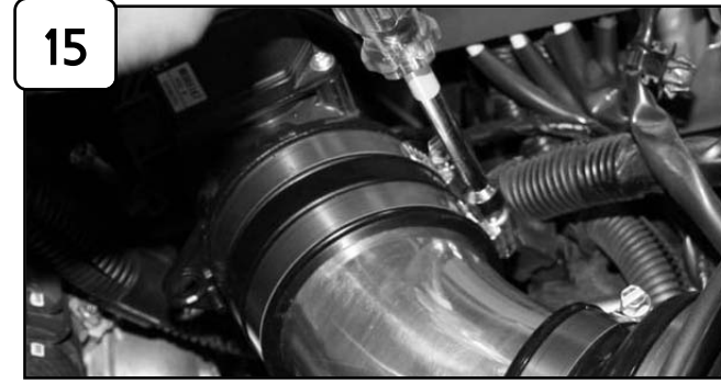
Tighten clamps using 5/16" nut driver.