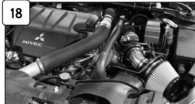
The installation of your Takeda performance intake is now complete. Please check all components and re-tighten if necessary. Thank you for choosing Takeda!