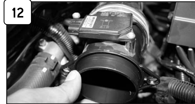
Install MAF sensor back to intake tube.