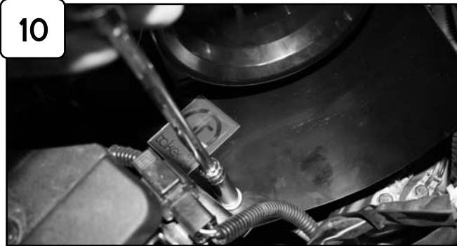
With provided washer and screw tighten down housing using 10mm socket or wrench.