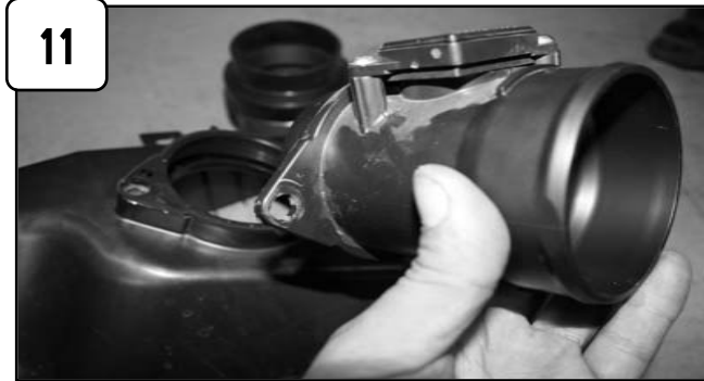
Remove MAF sensor from air box using 10mm socket or wrench.