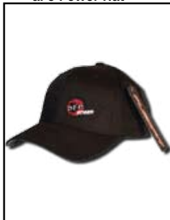
aFe Power Hat