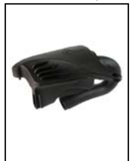
Pro DRY S Intake System