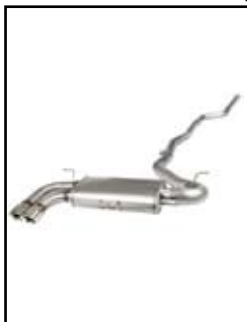
Catback Exhaust Polished Tips