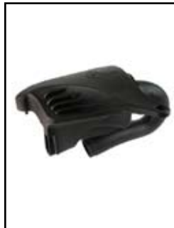
Pro 5R Intake System