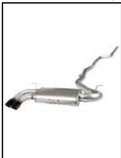
Catback Exhaust Black Tips