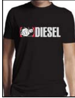
aFe Diesel Tee

P/N: 40-30221 (M) P/N: 40-30222 (L) P/N: 40-30223 (XL) P/N: 40-30224 (2XL) P/N: 40-30225 (3XL)