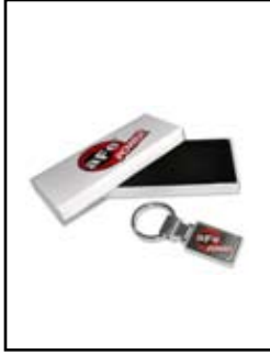
aFe Key Chain