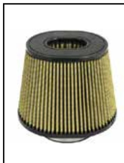
Pro-Guard 7 Air Filter