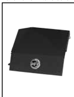
aFe Power Intake Cover