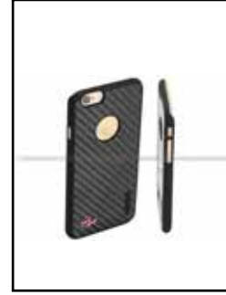
Cell Phone Case