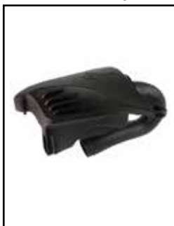
Pro 5R Intake System