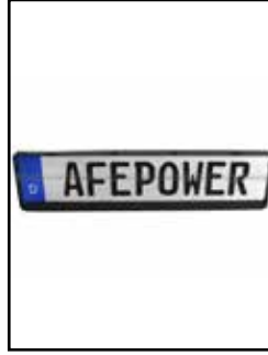
German License Plate