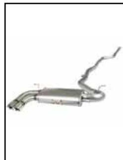
Catback Exhaust Polished Tips