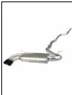
Catback Exhaust Black Tips