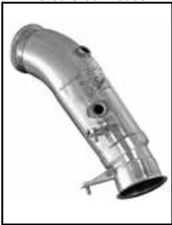
Twisted Steel Header