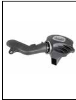
Pro 5R Intake System